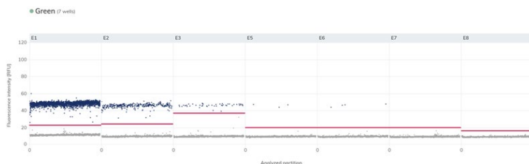
Figure 2. 1D Scatter Plot. Single-well data with auto thresholding (representative well of technical replicates) for the different experimental sample input amounts (Log 1, Log 2, Log 3) and depicted 2 replicates for Log 4 and NTC. Green channel for FAM detection.