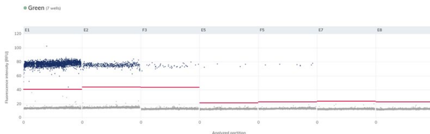
Figure 2. 1D Scatter Plot. Single-well data with autothresholding (representative well of technical replicates) for the different experimental sample input amounts (Log 1, Log 2, Log 3) and depicted 2 replicates for Log 4 and NTC. Green channel for FAM detection.