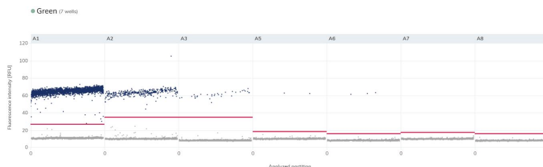
Figure 2. 1D Scatter Plot. Single-well data with autothresholding (representative well of technical replicates) for the different experimental sample input amounts (Log 1, Log 2, Log 3) and depicted 2 replicates for Log 4 and NTC. Green channel for FAM detection.