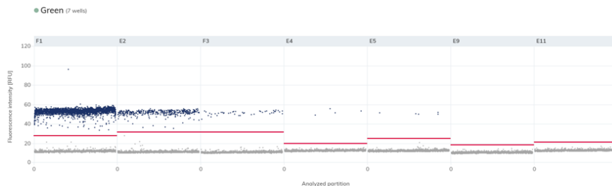
Figure 2. 1D Scatter Plot. Single-well data with autothresholding (representative well of technical replicates) for the different experimental sample input amounts (Log 1, Log 2, Log 3) and depicted 2 replicates for Log 4 and NTC. Green channel for FAM detection.